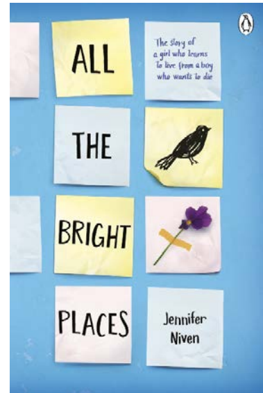
All the Bright Places by Jennifer Niven

Kirra and the ghost make a pact. She'll prove who murdered him almost twenty years ago if he makes her popular, gets her parents back together, and promises not to haunt her. But things aren't so simple, and Kirra realises that people can be haunted in more ways than one.