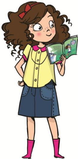
Alice-Miranda-Highton-Smith Kennington-Jones is . . .

Write down five words that describe each of the characters below. Use the adjectives provided for ideas, as well as thinking up your own words to describe them. There are no right or wrong answers!